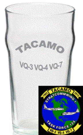
PICTURED ABOVE: PILSNER GLASS AND REUNION LOGO ON BLACK T-SHIRT

We are working on bringing new items to the store, so visit often for the latest gear.