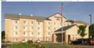
Fairfield Inn by Marriott Lexington Park...